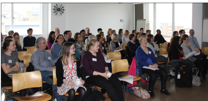
Clockwise from top left: Delegates at: Annual Conference (Sheffield), First meeting of the Routine Data Section (London), Applied Statisticians as Principal Investigators (Bristol)

Looking ahead, we’re holding our 3rd Annual Conference on 20-21 June 2019 in Sheffield. This year the title is “Driving Interprofessional Collaboration” and we will also be piloting a mentorship scheme at the conference. Several other one-day or half-day research meetings are planned —please see our website for more details.